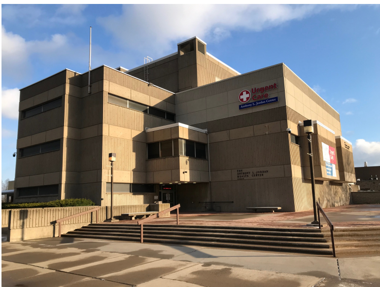
The Anthony L. Jordan Health Center at 82 Holland Street