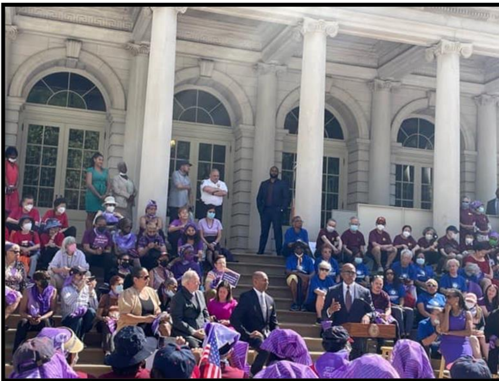
June 15 gathering on the steps of New York City Hall to announce additional support for elder abuse program services.