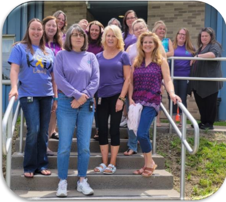
Lewis County Department of Social Services staff wore purple on June 15 to help raise awareness in the community.