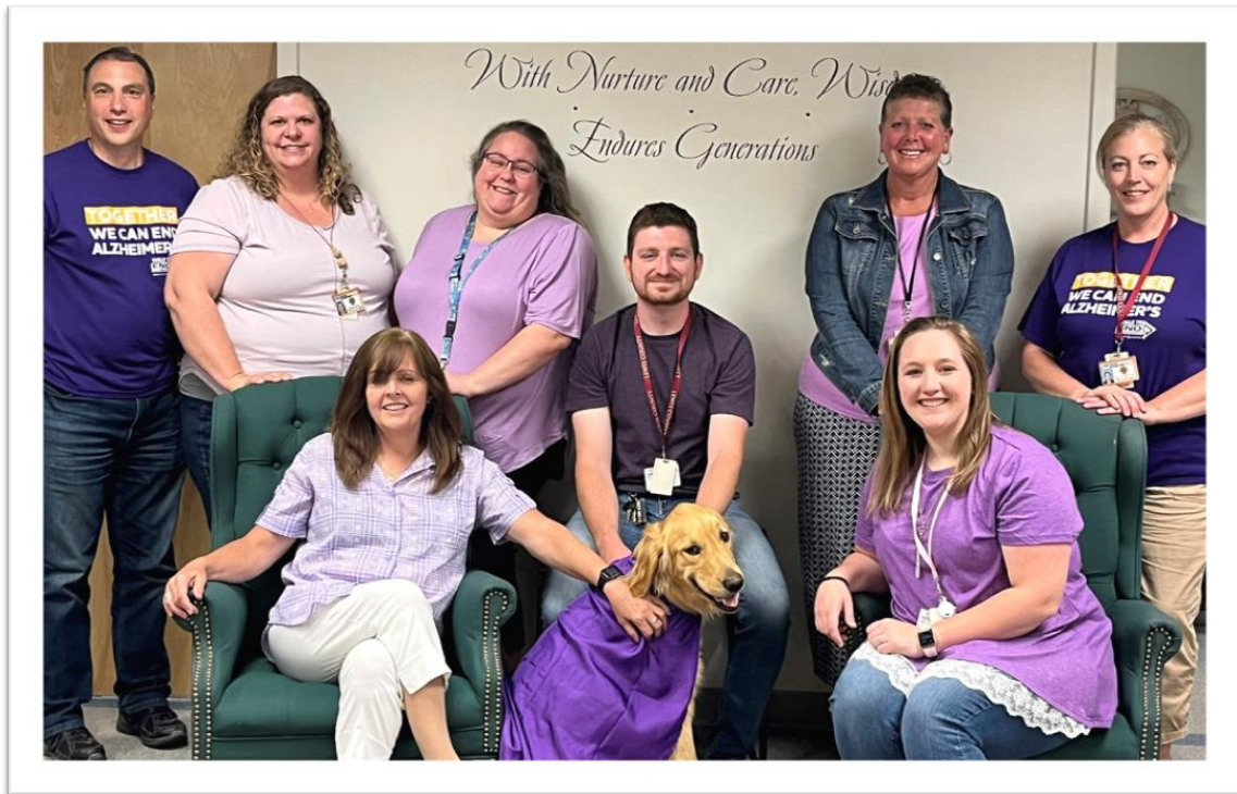
Lewis County Office for the Aging staff wearing purple to honor survivors and raise awareness.