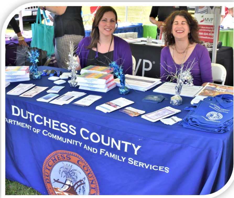
One of the many resource tables providing safety information for older adults at the June 15 th Dutchess County picnic.