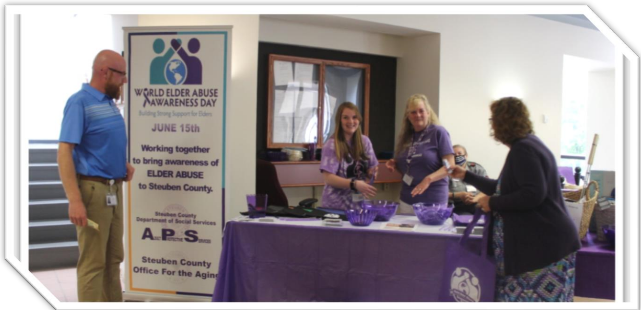
Steuben County DSS Adult Protective Services brought awareness of elder abuse to the County Office Building 1 st floor lobby on June 15.