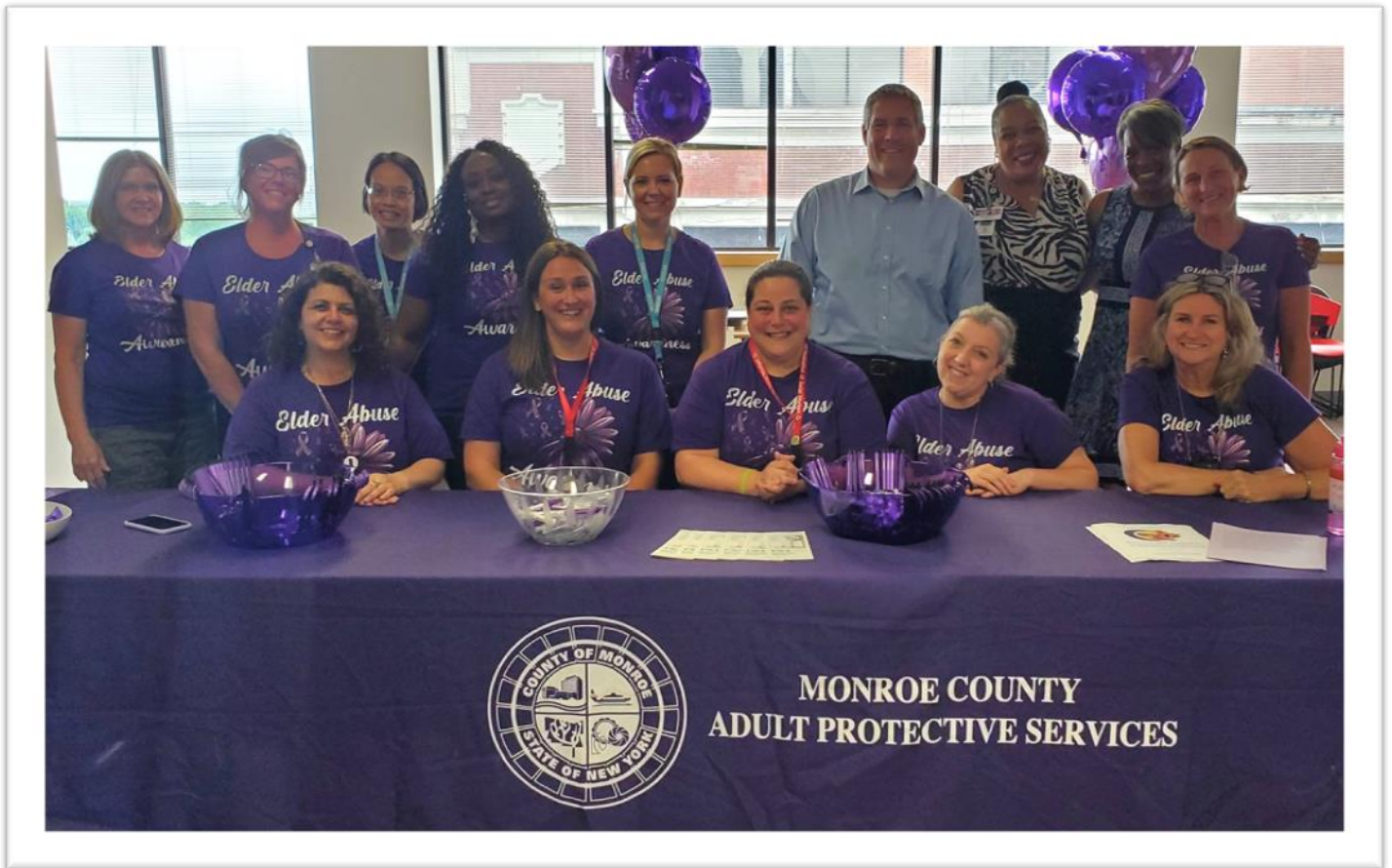
Monroe County Executive thanked the Adult Protective Services team for all they do to protect seniors.