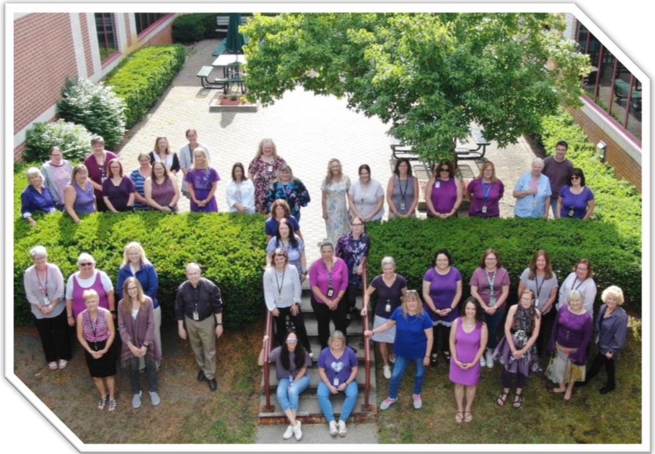
Washington County Department of Social Services and Office for Aging and Disabilities Resource Center gathered in unity by wearing purple to help bring awareness to elder abuse.