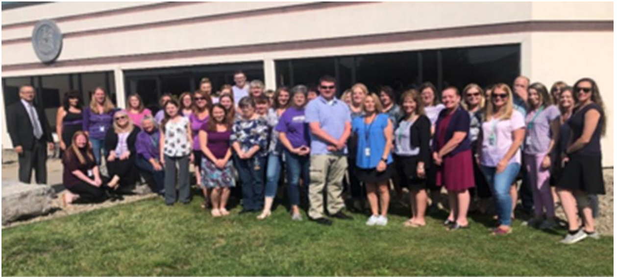
Cattaraugus County Department of Social Services and Department of the Aging staff wore purple and gathered in front of the Olean County Building to bring attention to Elder Abuse Awareness Month.