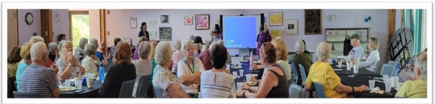
June 15 th WEAAD afternoon event at the Saratoga Senior Center included lunch, live music, and several informational presentations. Sixty-five seniors, staff, volunteers, and senior service providers learned about elder abuse, neglect, financial exploitation, and scams from Senior Center and Mechanicville Domestic Violence Advocacy Program staff.