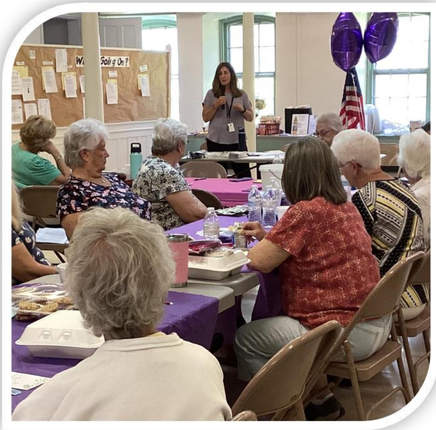
Washington County OFA Nutrition Program WEAAD presentation by Adult Protective Services and the Sheriff's Office.